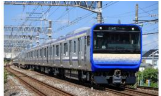
Figure-1 Exterior of an E235 series railcar

This project is to manufacture and introduce a new type of railcars that combine improved environmental friendliness through the latest energy-saving technologies, improved operational stability through the use of dual systems for major equipment and the latest condition monitoring functions, and improved comfortability by introducing wider seats (see Figure-1). DNV has confirmed that the project is progressing smoothly.