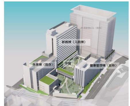
Figure-3 Exterior image

This project is to rebuild the wards (inpatient wing) of JR Tokyo General Hospital, which was constructed for more than 40 years ago, as well as to build a new Healthcare Wing (tentative name) and a new courtyard (see Figure-3). The Healthcare Wing (tentative name) is scheduled to open in the spring of 2024, and the new ward (inpatient wing) in the spring of 2025. DNV has confirmed that the project is progressing as planned.