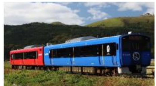
Figure-2 Exterior of an EV-E801 series train

This project is to manufacture and introduce the accumulator railcar train EV-E801 series AC Storage Battery-driven trains, which are equipped with large-capacity storage batteries and can run even in non-electrified sections (see Figure-2). DNV has confirmed that the project has been completed and that the target number of six trains is running smoothly.