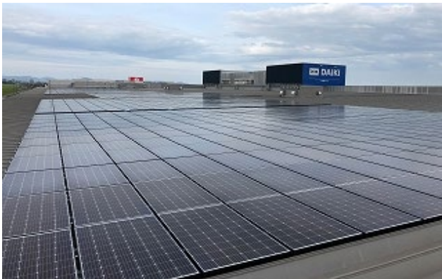
a) Daiki Okayama(500kW Okayama Aug.2018)