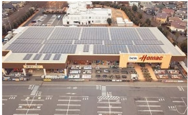
d) Homac Tsukubamirai(400kW Ibaraki Jan. 2019)