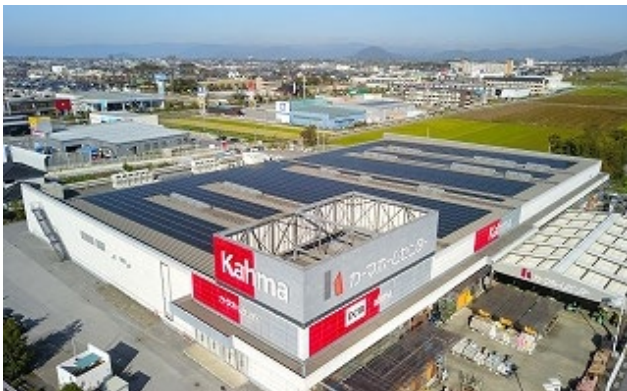
c) Kahma Nagahama(300kW Shiga Sep. 2018)