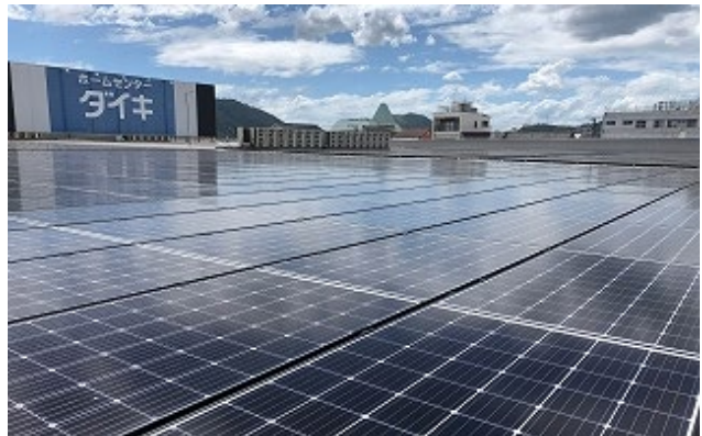
b) Daiki Mihara-enichi (350kW Hiroshima Jul. 2018)