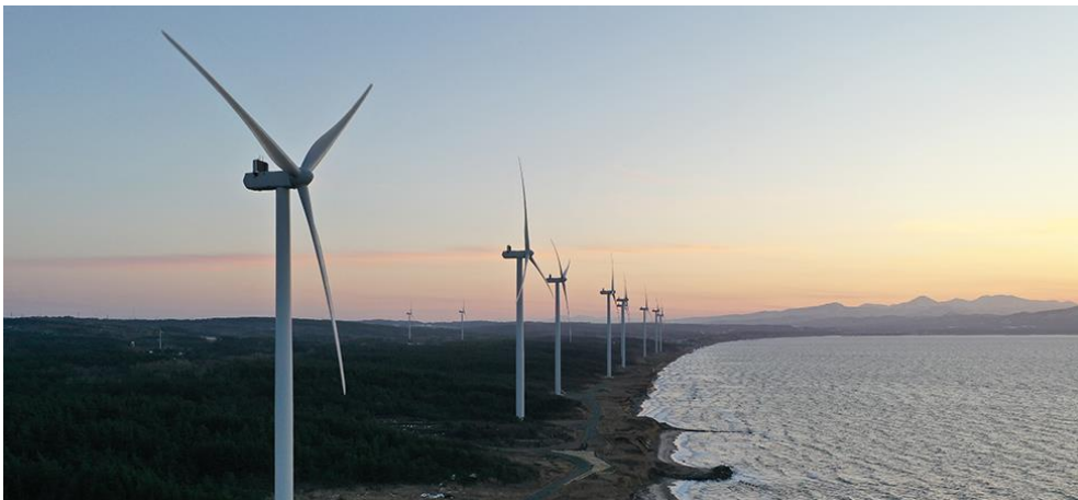
Figure-4 Noheji Mutsu Bay Wind Farm

Renewable energy sources are projects that contribute to the decarbonisation of power sources in the “Daigas Group Roadmap to Carbon Neutrality” and are positioned as a necessary initiative for the realisation of Osaka Gas' Transition Strategy.