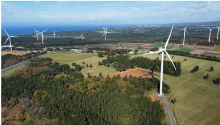
Figure-5 Yokohama Town Wind Farm

Renewable energy sources are projects that contribute to the decarbonisation of power sources in the “Daigas Group Roadmap to Carbon Neutrality” and are positioned as a necessary initiative for the realisation of Osaka Gas' Transition Strategy.