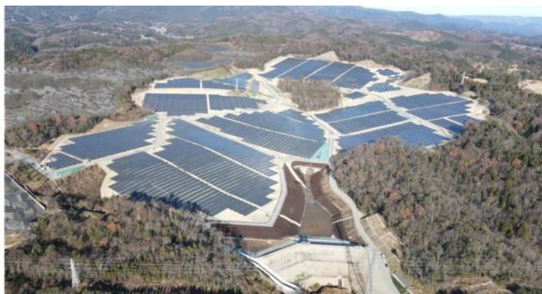
Figure-7 Isohara Extra-high Power Plant

Renewable energy sources are projects that contribute to the decarbonisation of power sources in the “Daigas Group Roadmap to Carbon Neutrality” and are positioned as a necessary initiative for the realisation of Osaka Gas' Transition Strategy.