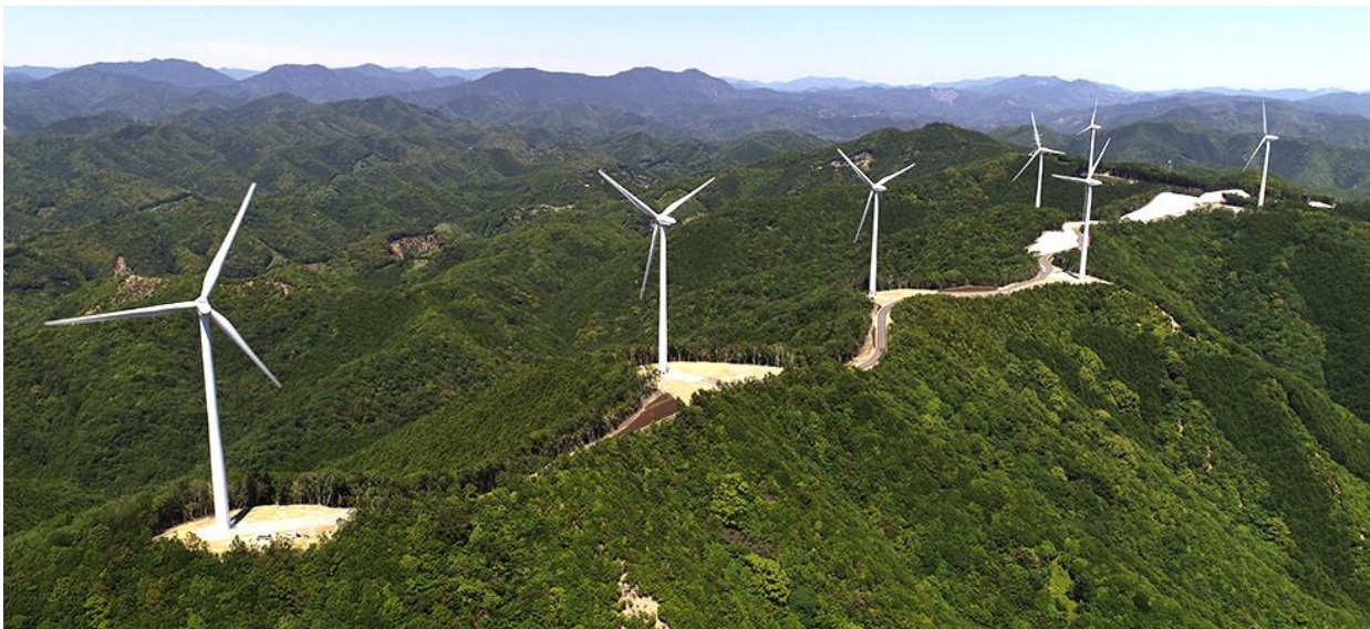
Figure-2 Inami Wind Power Plant

Renewable energy sources are projects that contribute to the decarbonisation of power sources in the "Daigas Group Roadmap to Carbon Neutrality" and are positioned as a necessary initiative for the realisation of Osaka Gas' Transition Strategy.