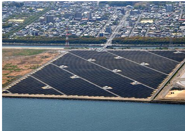
Figure-3 Daigas Oita Mirai Solar Power Plant

Renewable energy sources are projects that contribute to the decarbonisation of power sources in the “Daigas Group Roadmap to Carbon Neutrality” and are positioned as a necessary initiative for the realisation of Osaka Gas' Transition Strategy.