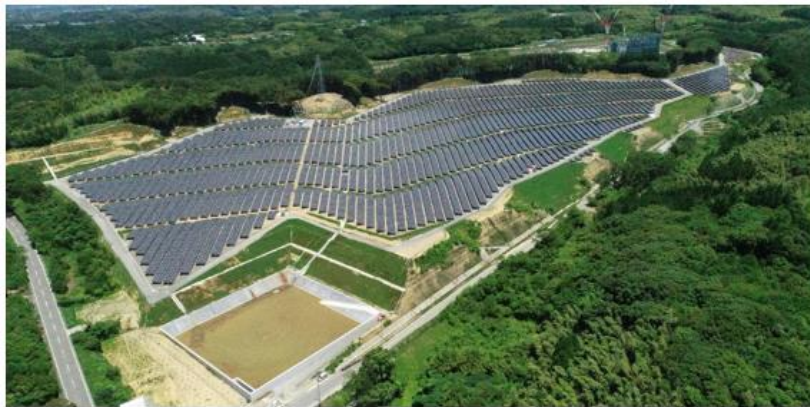
Figure-6 Kuwaharajyou Mega Solar (No. 4)

Renewable energy sources are projects that contribute to the decarbonisation of power sources in the “Daigas Group Roadmap to Carbon Neutrality” and are positioned as a necessary initiative for the realisation of Osaka Gas' Transition Strategy.